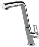
Mixer Tap KE