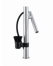
Mixer Tap Bert